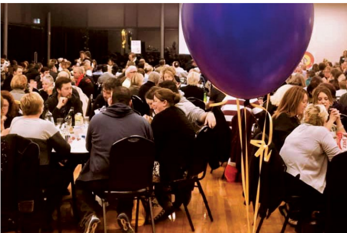
RSB Quiz Night, Thebarton Community Centre.