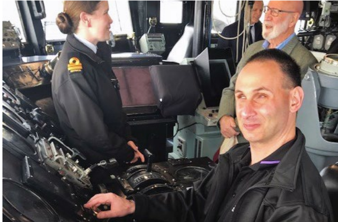
HMAS Adelaide III Open Day.