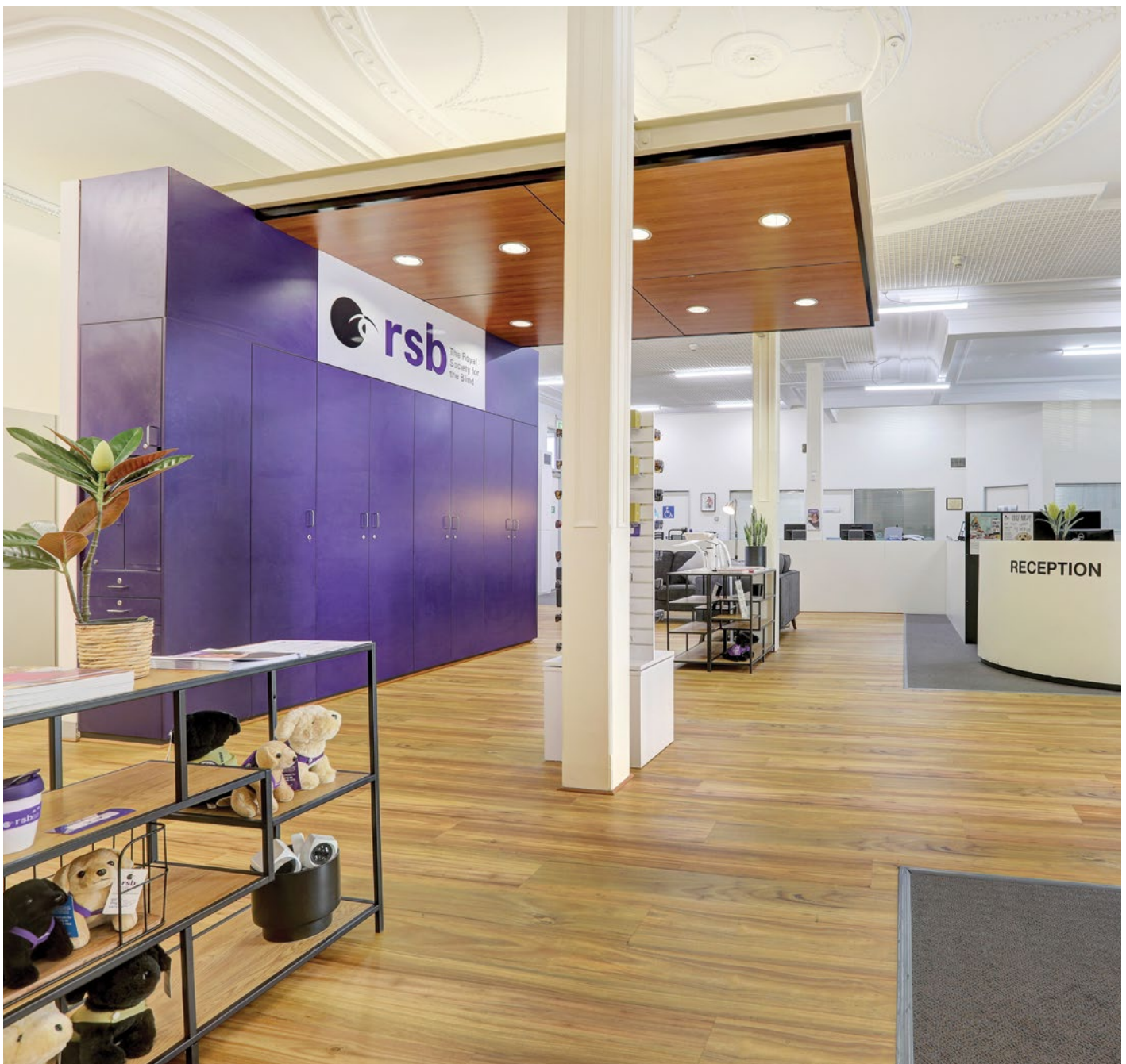
The re-design of Knapman House.

Technology Centre, on the ground floor of Knapman House. A re-design of the area opened it up, providing an improved lay-out that is much easier to navigate, interact with products, or sit in comfort if arriving early for an appointment.