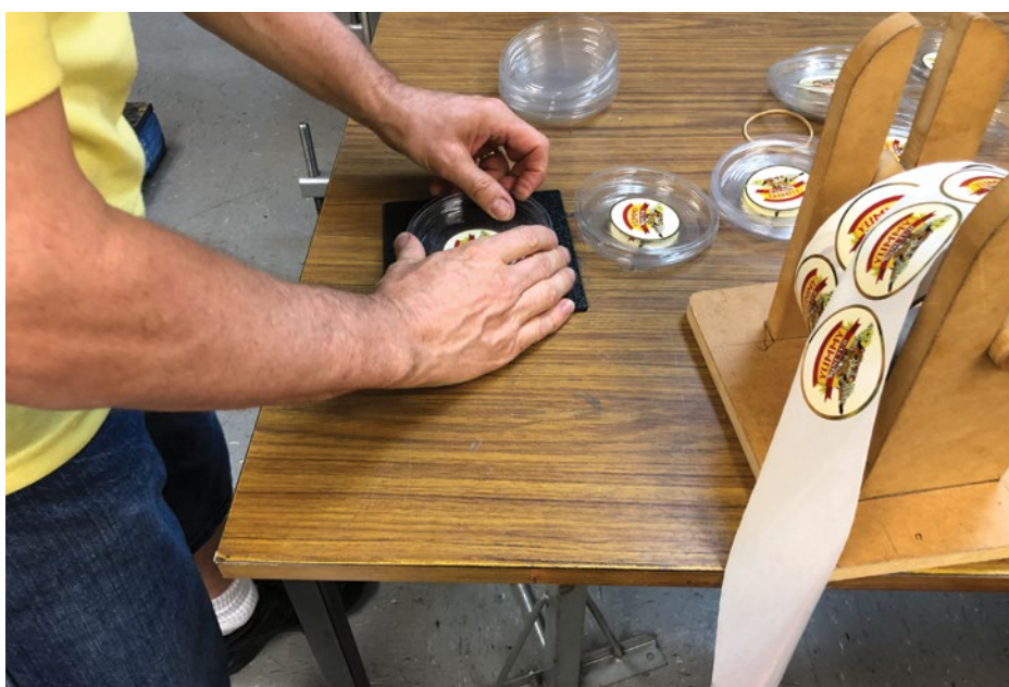
Food packaging being completed for Yummy Snack Foods.

We also welcomed some new vision and hearing-impaired staff into the fold, working across a variety of tasks.