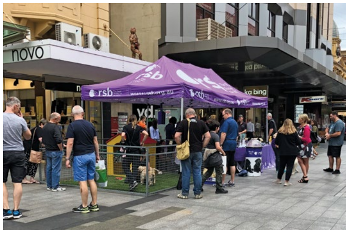
International Guide Dog Day, Rundle Mall.