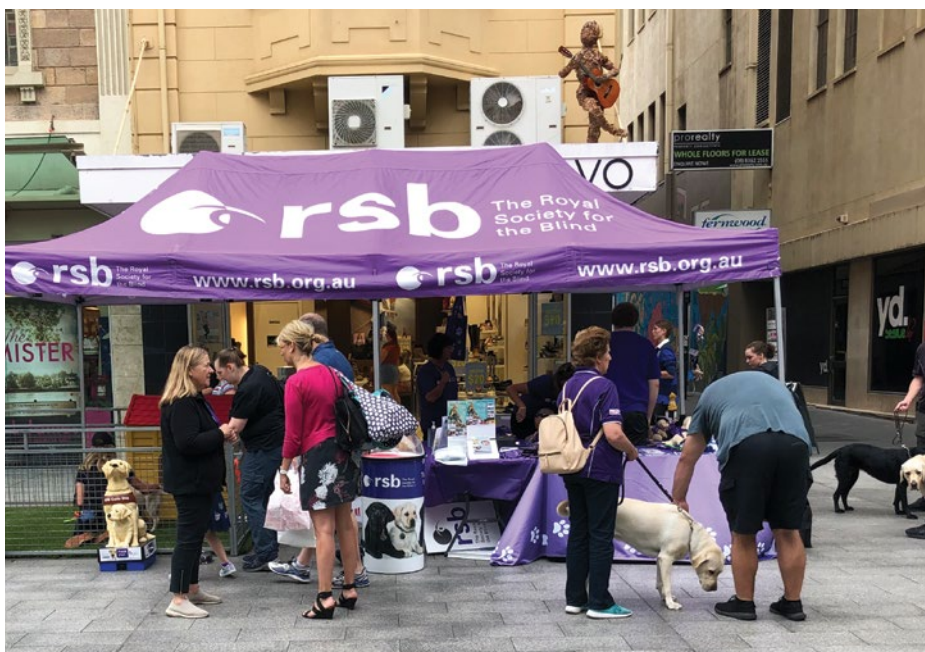
International Guide Dog Day, Rundle Mall.