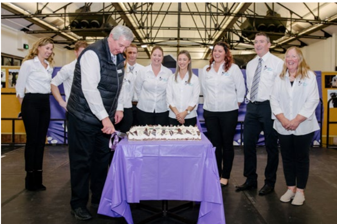
Guide Dog Graduation, Torrens Parade Ground.