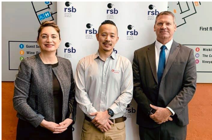
Memorandum of Understanding signing with SAGE Automation at the International TechFest.