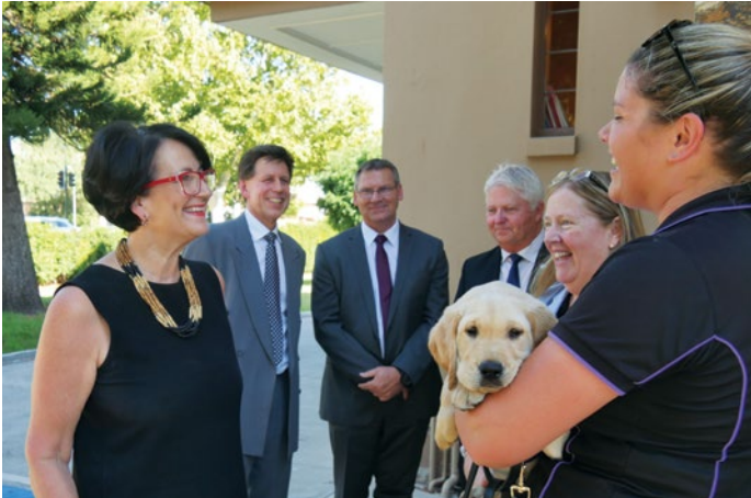
Operation K9 Corporate Showcase.